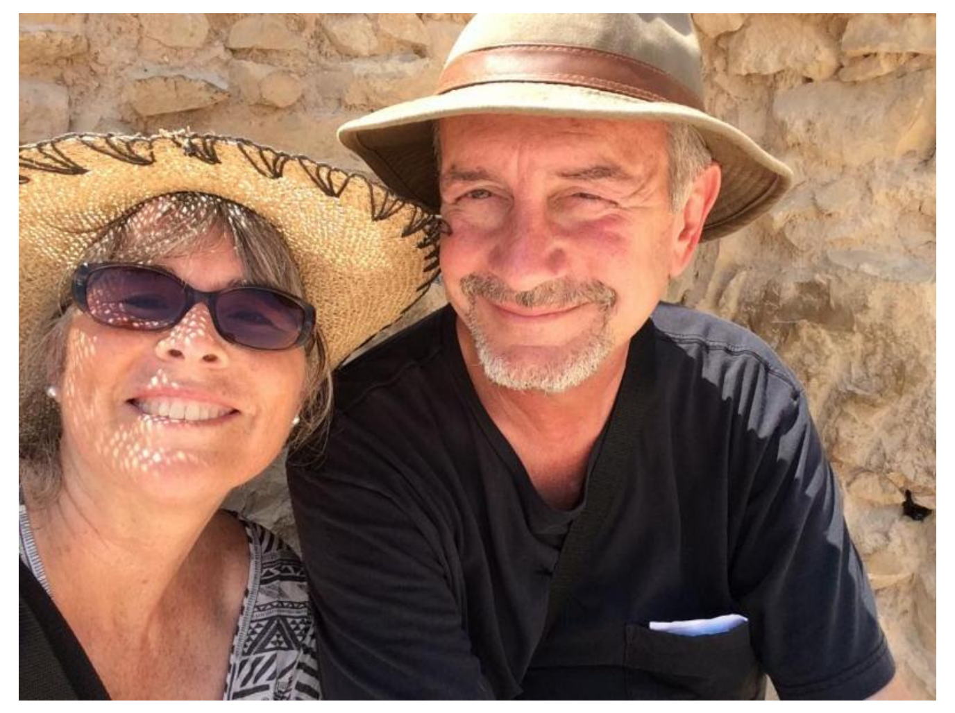
First paragraph of blog post here: — ANYTHING CAN GO HEREEdit